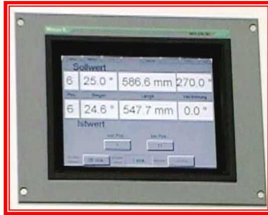
SPS control panel