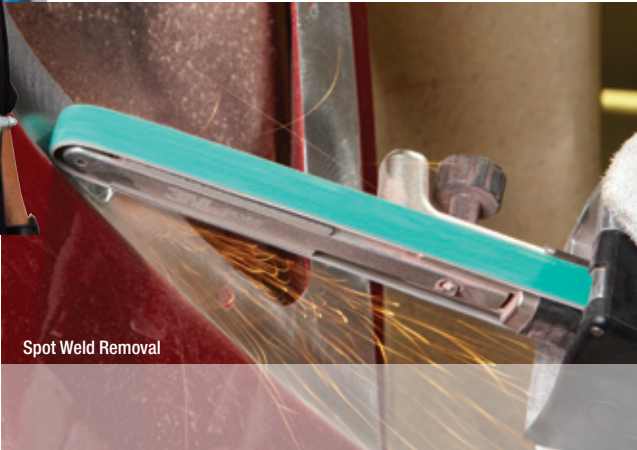
Spot Weld Removal

Fast Cut • Improved Control • Reduced Fatigue Ideal for Hard-to-reach Spots