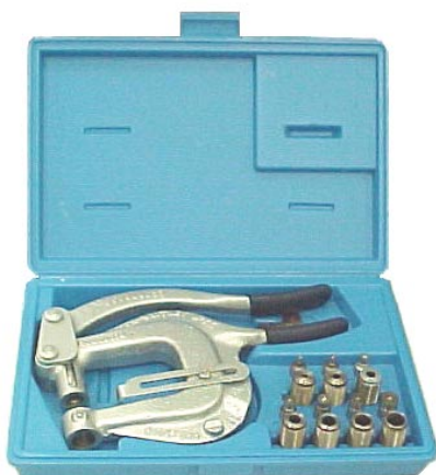
NO. XX TOOL IN KIT