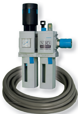
Art. Nr. 24203