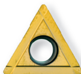
Art. Nr. 24204