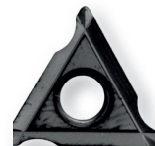
Art. Nr. 24202