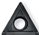
Art. Nr. 24201