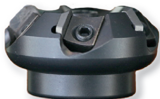
Art. Nr. 28221