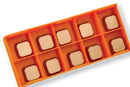
Art. Nr. 25909