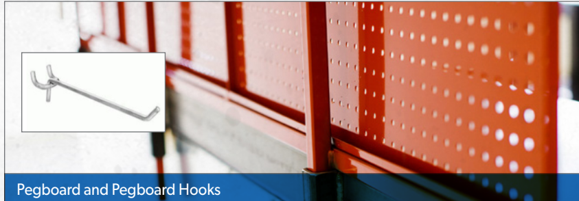
Pegboard and Pegboard Hooks