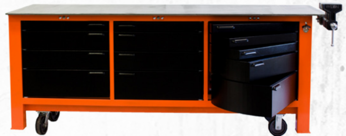
Above model shown with keyed locks, casters, vise & receiver