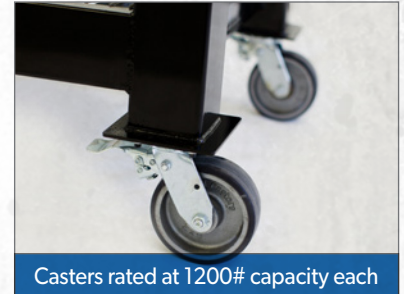
Casters rated at 1200# capacity each