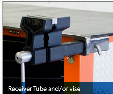
Receiver Tube and/or vise