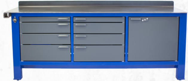
Above model shown with receiver tube option