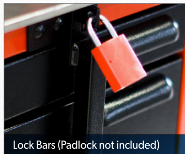
Lock Bars (Padlock not included)