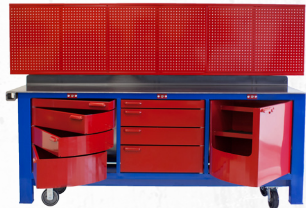
Above model shown with pegboard, receiver, keyed locks, and casters